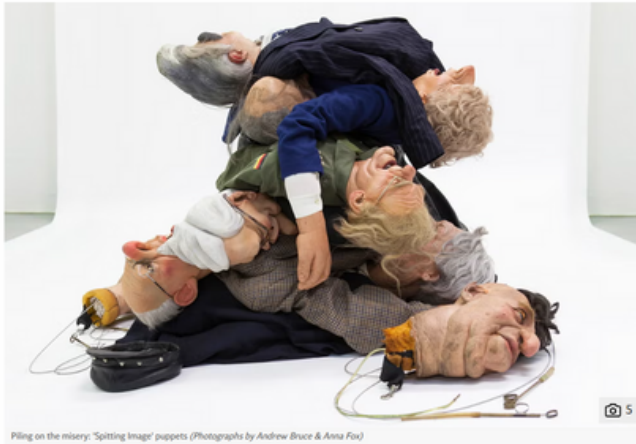
Piling on the misery: 'Spitting Image' puppets