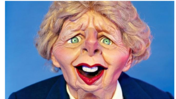
Spitting- Margaret Thatcher, Pigment print, 2015