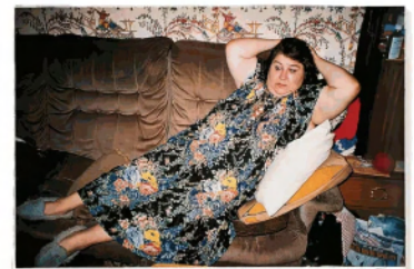
Untitled (NRAL 2 from Ray's a Laugh), 1994, Richard Billingham

More than a woman: images of female empowerment - in pictures