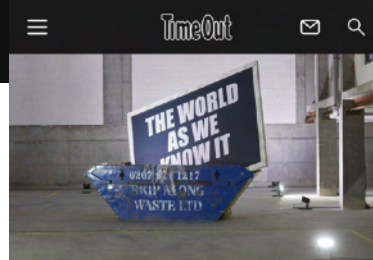
© Sarah Maple Courtesy Centre for British Photography, London | USE STRICTLY BY WRITTEN AGREEMENT